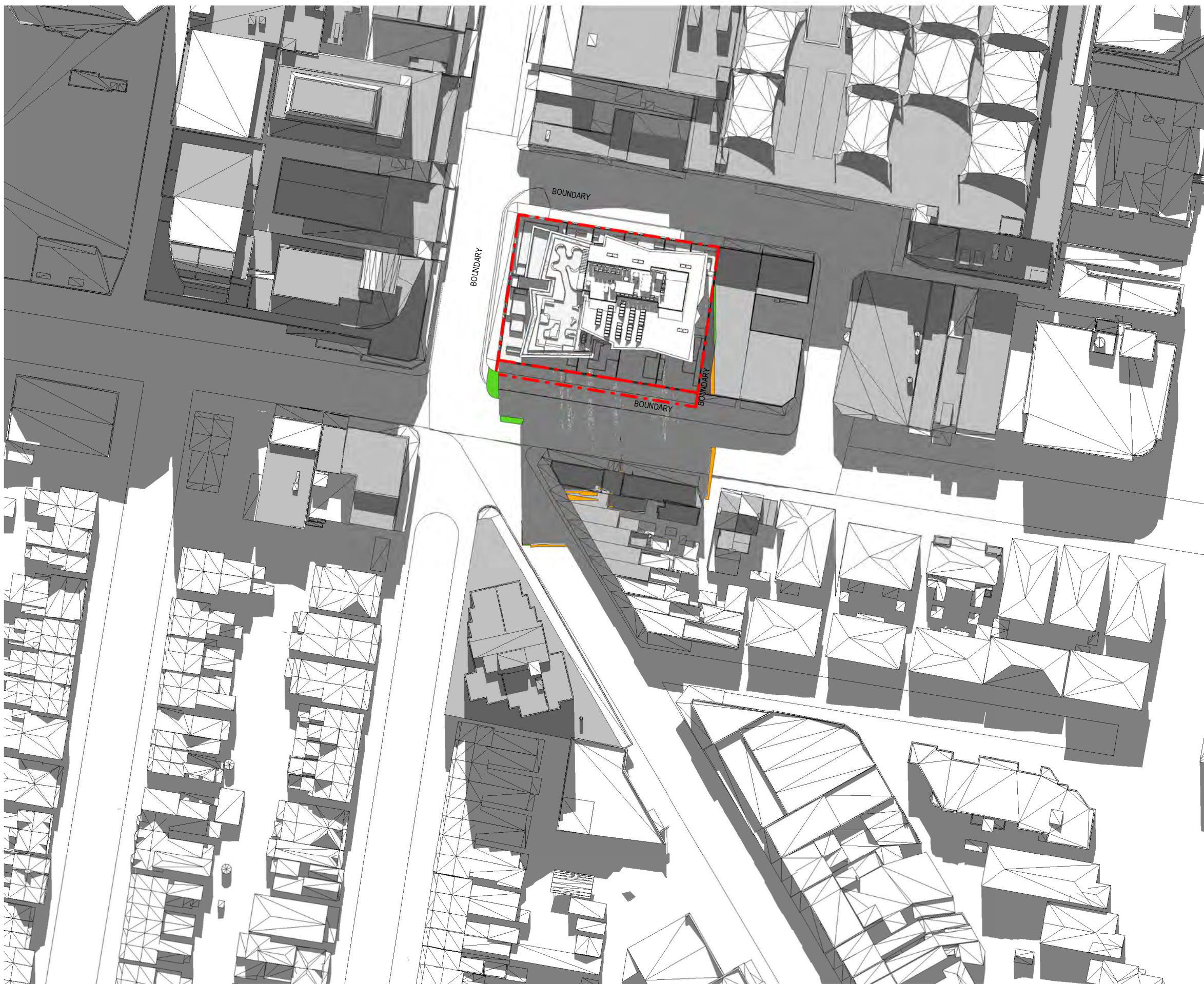
4 SOLAR ANALYSIS - 12PM (PROPOSED vs APPROVED) 1:1000

RECEIVED Waverley Council Application No: DA-533/2017/1/A Date Received: 01/10/2020