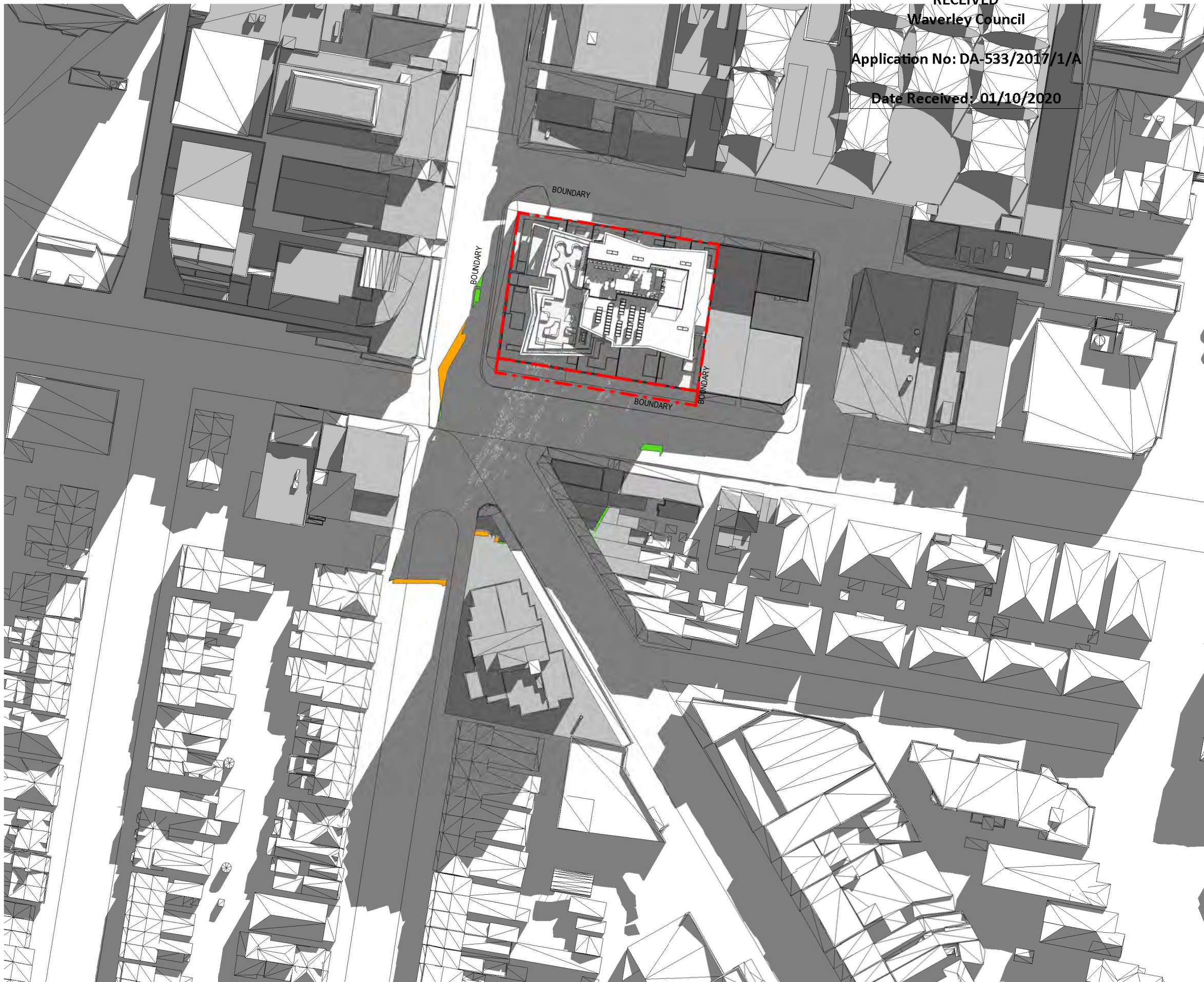
2 SOLAR ANALYSIS - 10AM (PROPOSED vs APPROVED) 1:1000