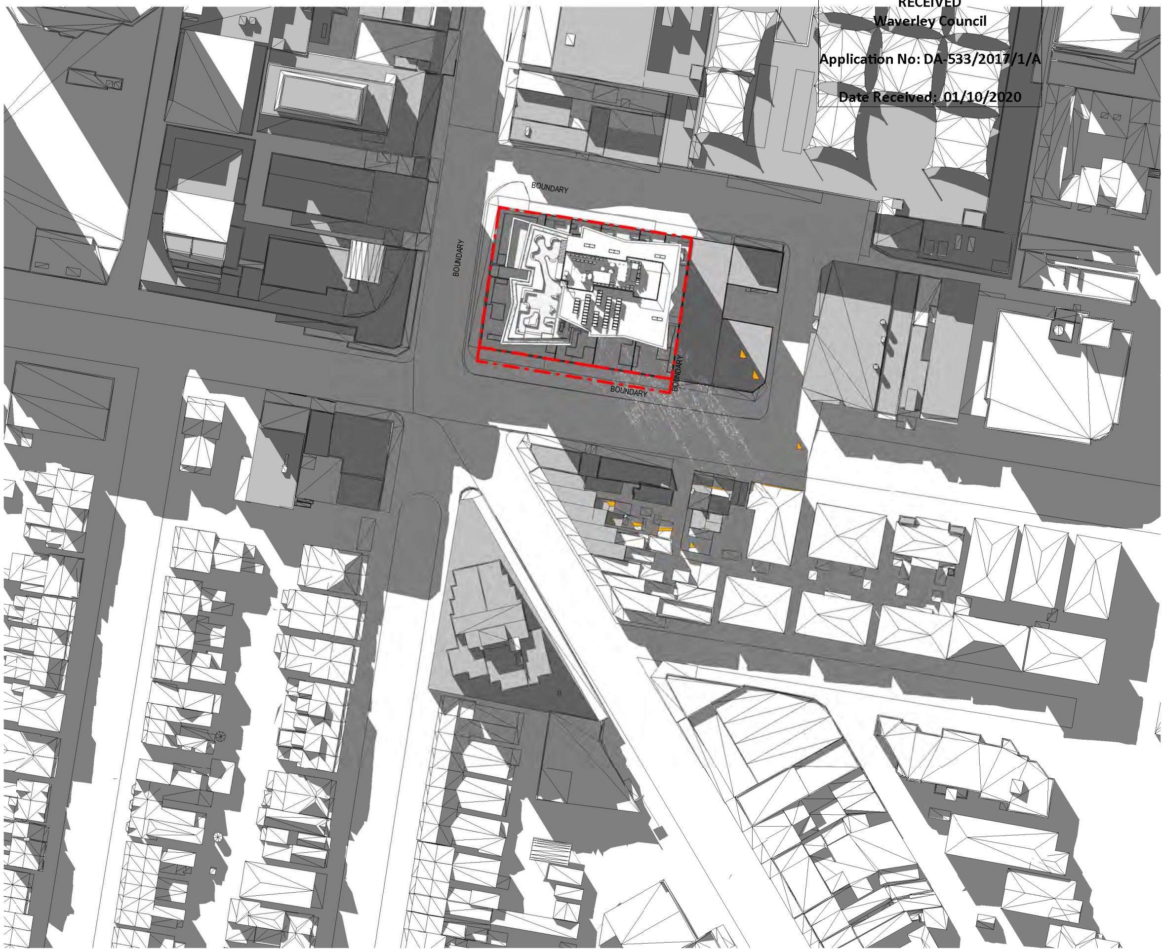
2 SOLAR ANALYSIS - 2PM (PROPOSED vs APPROVED) 1 : 1000