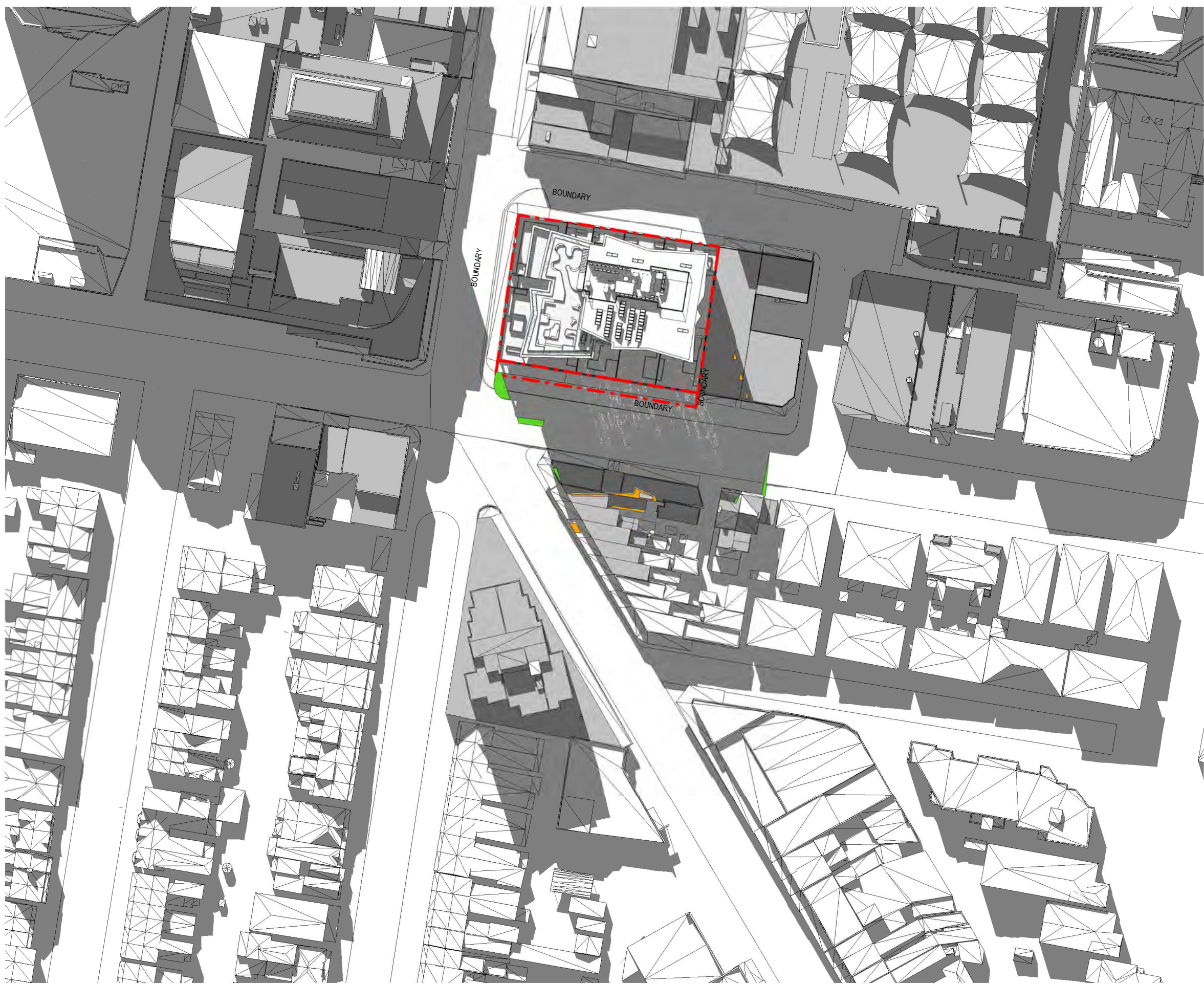
1 SOLAR ANALYSIS - 1PM (PROPOSED vs APPROVED) 1 : 1000