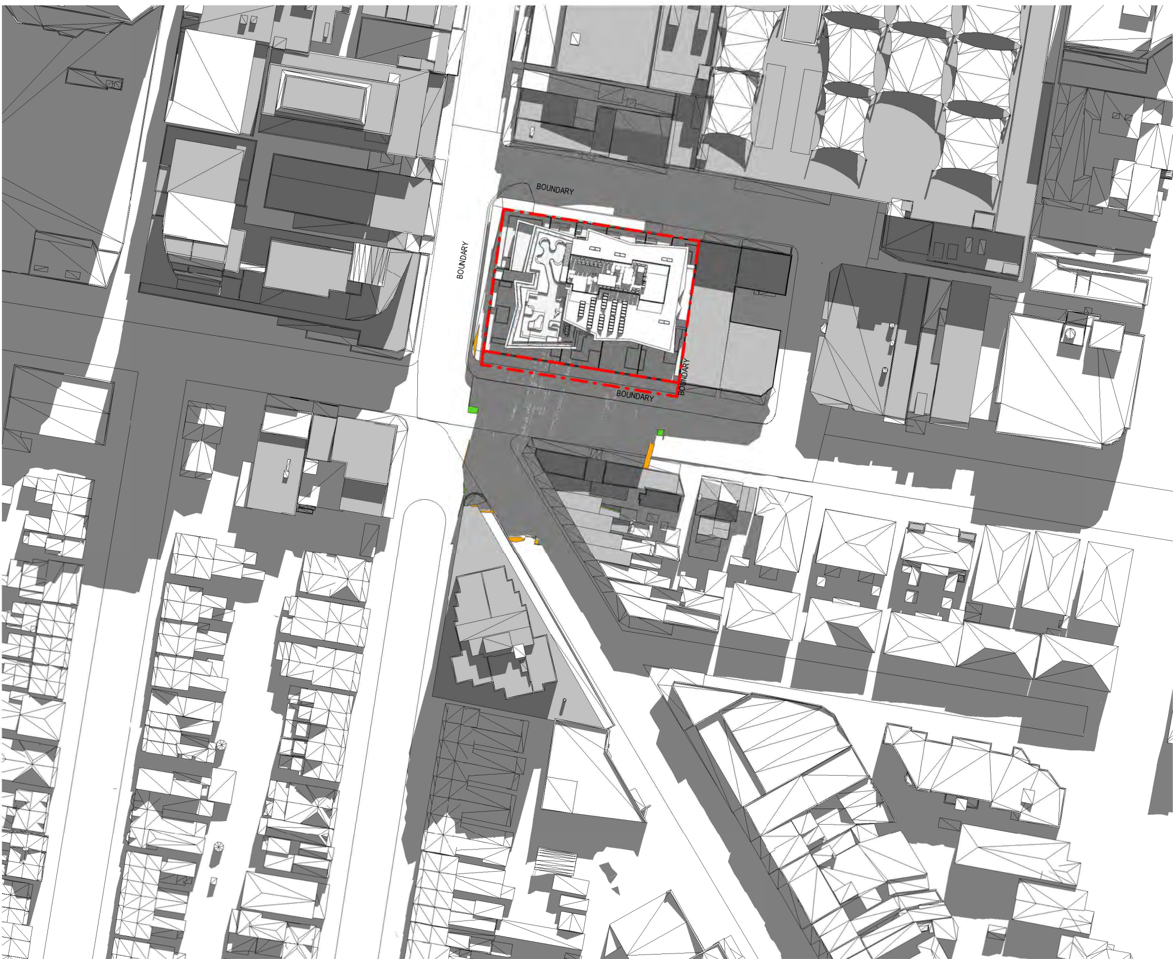
3 SOLAR ANALYSIS - 11AM (PROPOSED vs APPROVED) 1:1000