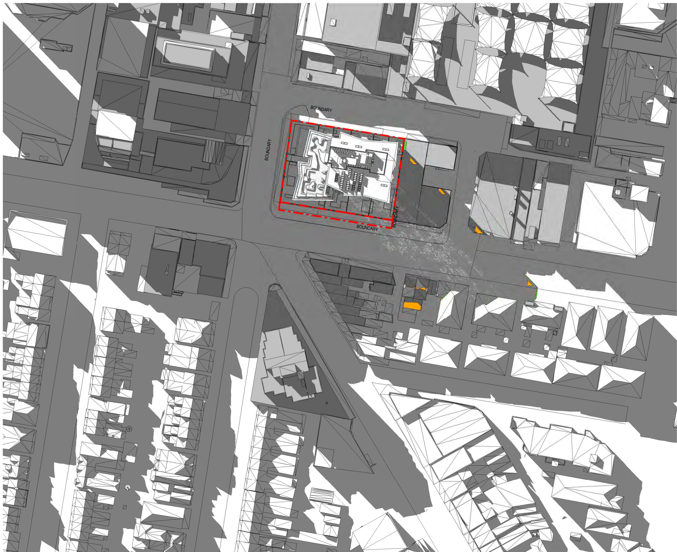
3 SOLAR ANALYSIS - 3PM (PROPOSED vs APPROVED) 1 : 1000

RECEIVED Waverley Council Application No: DA-533/2017/1/A Date Received: 01/10/2020