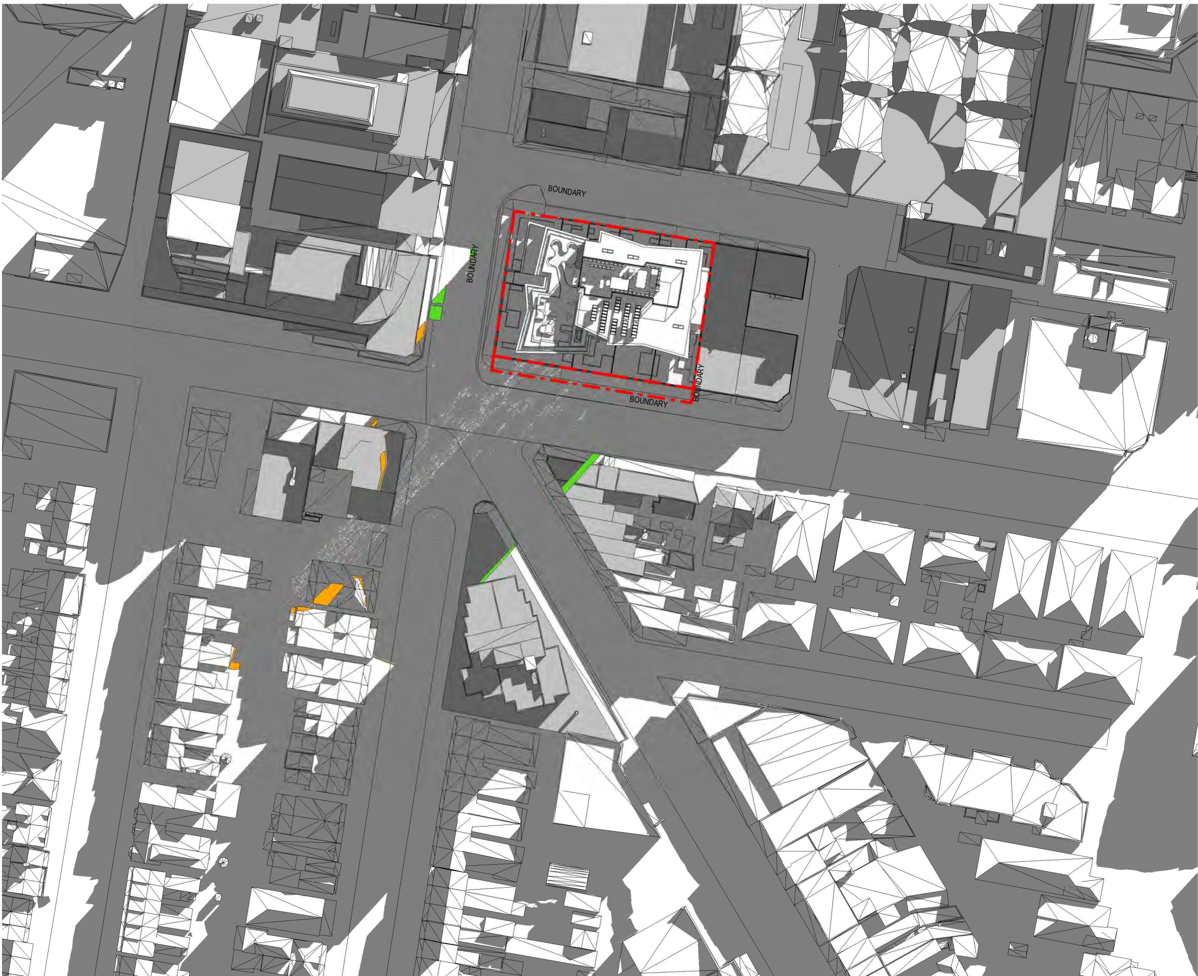
1 SOLAR ANALYSIS - 9AM (PROPOSED vs APPROVED) 1:1000